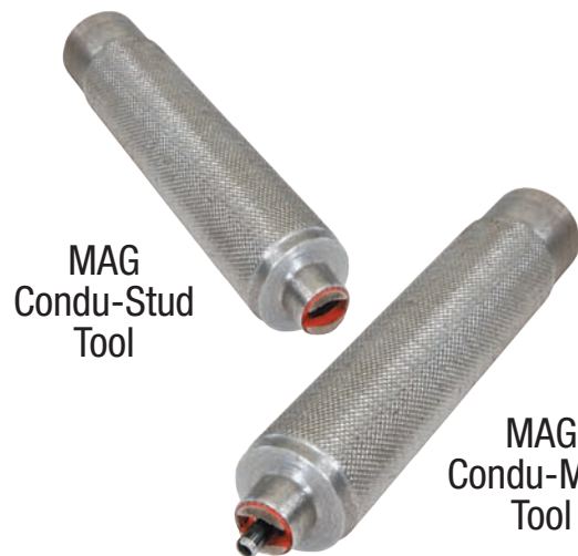
MAG Condu-Stud Tool