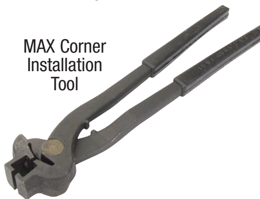
MAX Corner Installation Tool