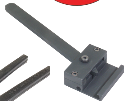
Dimple Cleat Tool