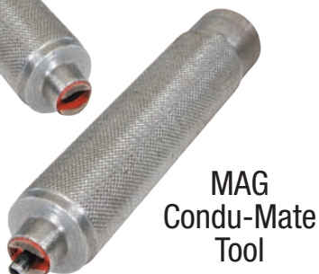
MAG Condu-Mate Tool