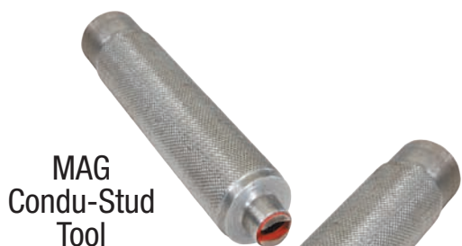
MAG Condu-Stud Tool